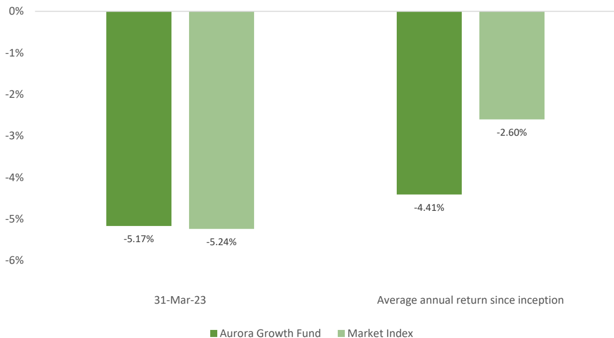
Annual Return Graph ii

This shows the return after fund charges and tax for each year ending 31 March since the fund started. The last bar shows the average annual return since the fund started, up to 30 June 2023