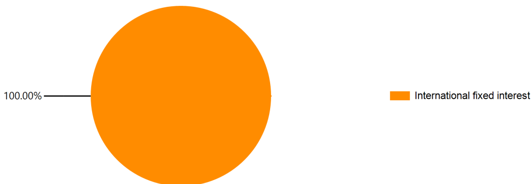
Target Investment Mix

As detailed in the SIPO, the target asset mix does not include cash held by the underlying fund.