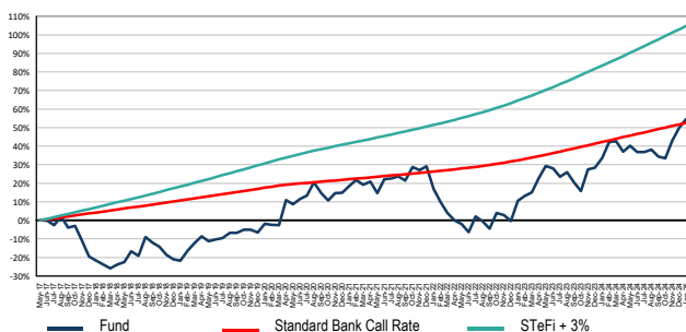
Fund Source: Apex Fund and Corporate Services SA as of January 2025 Index Source: Bloomberg as of January 2025