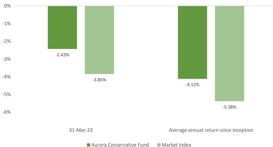
Annual Return Graph ii

This shows the return after fund charges and tax for each year ending 31 March since the fund started. The last bar shows the average annual return since the fund started, up to 31 March 2023